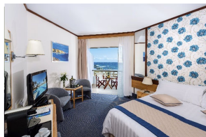
Standard Twin Room