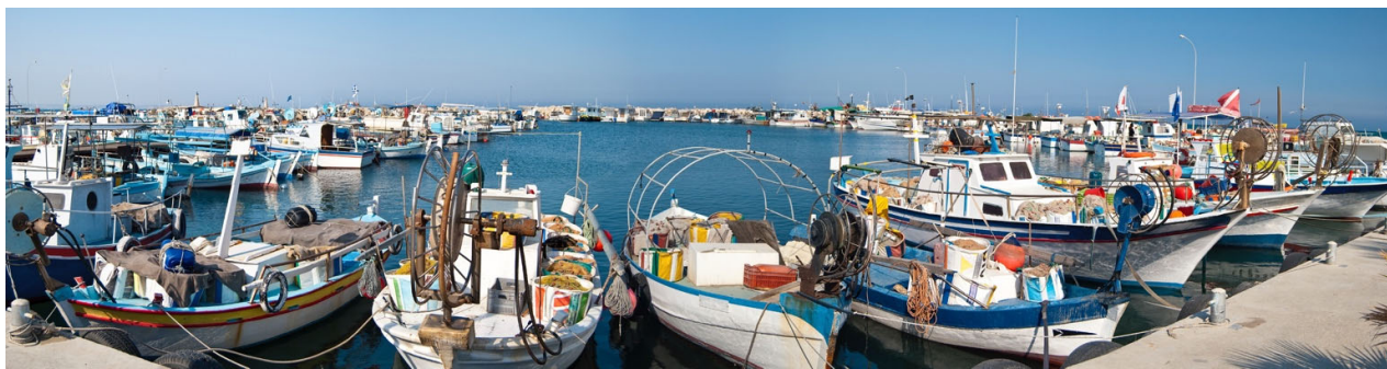
Fishing Boats In Paphos Harbour