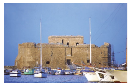
Paphos Harbour Fort