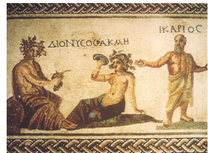
An Ancient Paphian Mosaic