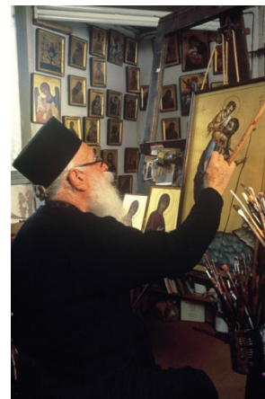
Traditional Icon Painting

The Akamas Peninsula – Explore one of the wildest least disturbed areas of the island, largely protected today as a nature reserve. Slip back in time to a majestic, scenic, tranquil, and largely undeveloped Cyprus.